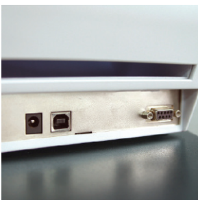
Standard with, Serial and USB ports

Ultra-compact DT2Us & DT2x are perfect for limited work spaces. Great for Retails, shipping labels, and healthcare applications