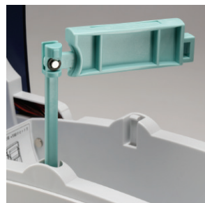
Direct thermal labels only, no ribbon required