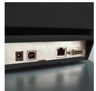
Standard with Ethernet, Serial and USB ports